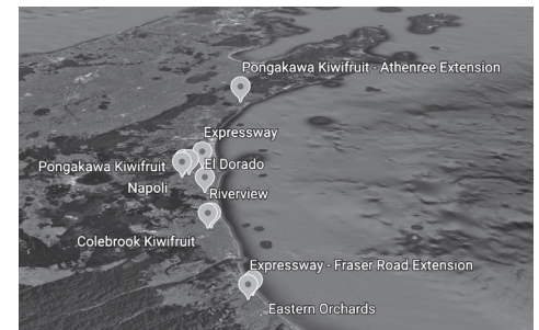
Figure 2: Location of MyFarm SunGold kiwifruit syndicates in Bay of Plenty

Since 2017, we've enabled our investors to purchase 12 SunGold kiwifruit orchards at different stages of development through to full maturity. In total the properties represent 119 cha of which 96 cha is in SunGold kiwifruit producing an average of 12,700 trays/cha (including a Northland orchard in its first year of development). Mature orchards are producing from 14,500 trays/cha to over 17,000 trays/cha. MyFarm's highest production orchard, Napoli, is DMS Progrowers highest producing commercial orchard.